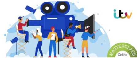
Online Masterclass: ITV

On 28 February, we welcome NIG to host our latest Masterclass. Hear directly from some of their team on the apprenticeship programme they have starting this September and ask them any questions you have.