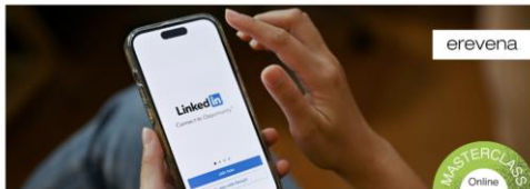
Online Masterclass: Erevena | Getting the most from LinkedIn

These sessions are available during term time