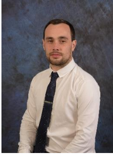
Dean is located at: Beech Avenue Secondary