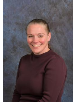
Alice is located at: Beech Avenue, Secondary