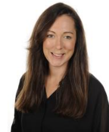
Charlotte is located at: Beech Avenue Primary