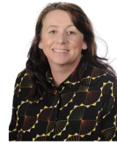
Heather is located at: Alton Close