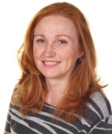
Emma is located at: Alton Close